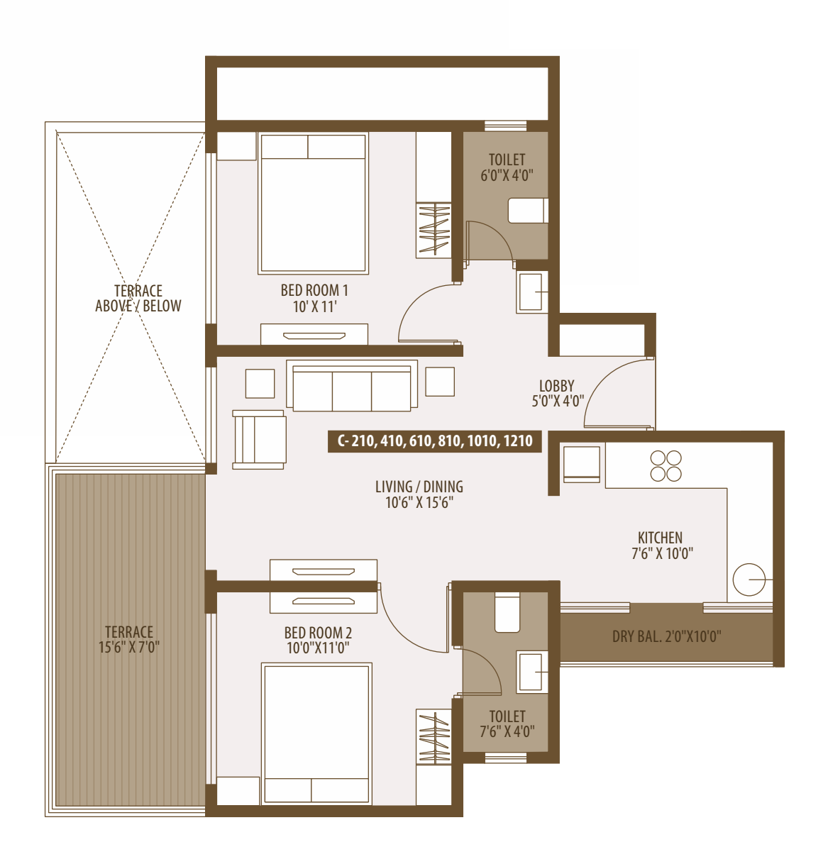
SALEBLE AREA STATEMENT (SQ. FT.)